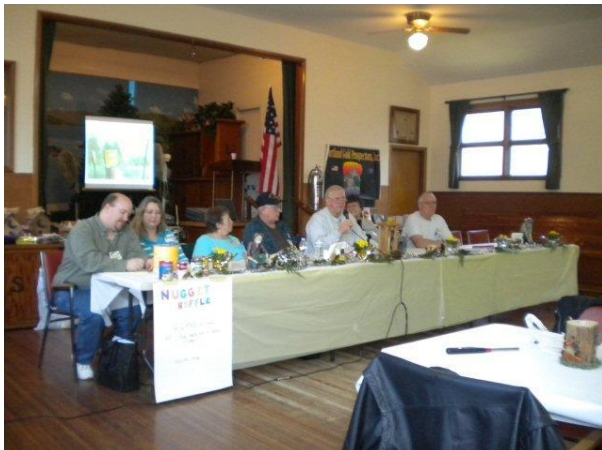
Board Members at the Annual Banquet