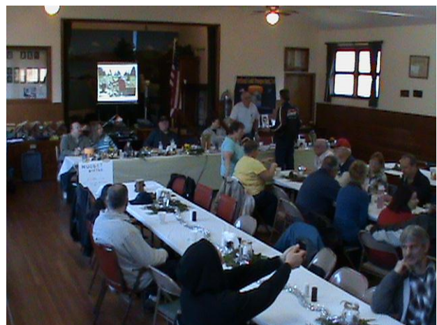
A good time was had by all!