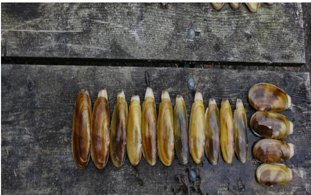
There are other things to do while at the beach.