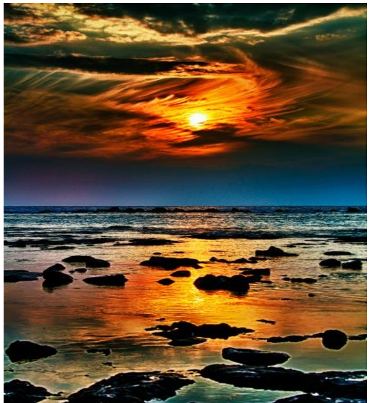
Sunset in Hawaii