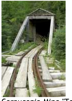
Cornucopia Mine "Today"

Tags: Cornucopia, Cornucopia Mine, Last Chance Mine, Queen of the West Mine, Red Jacket Mine, Union-Companion Mine