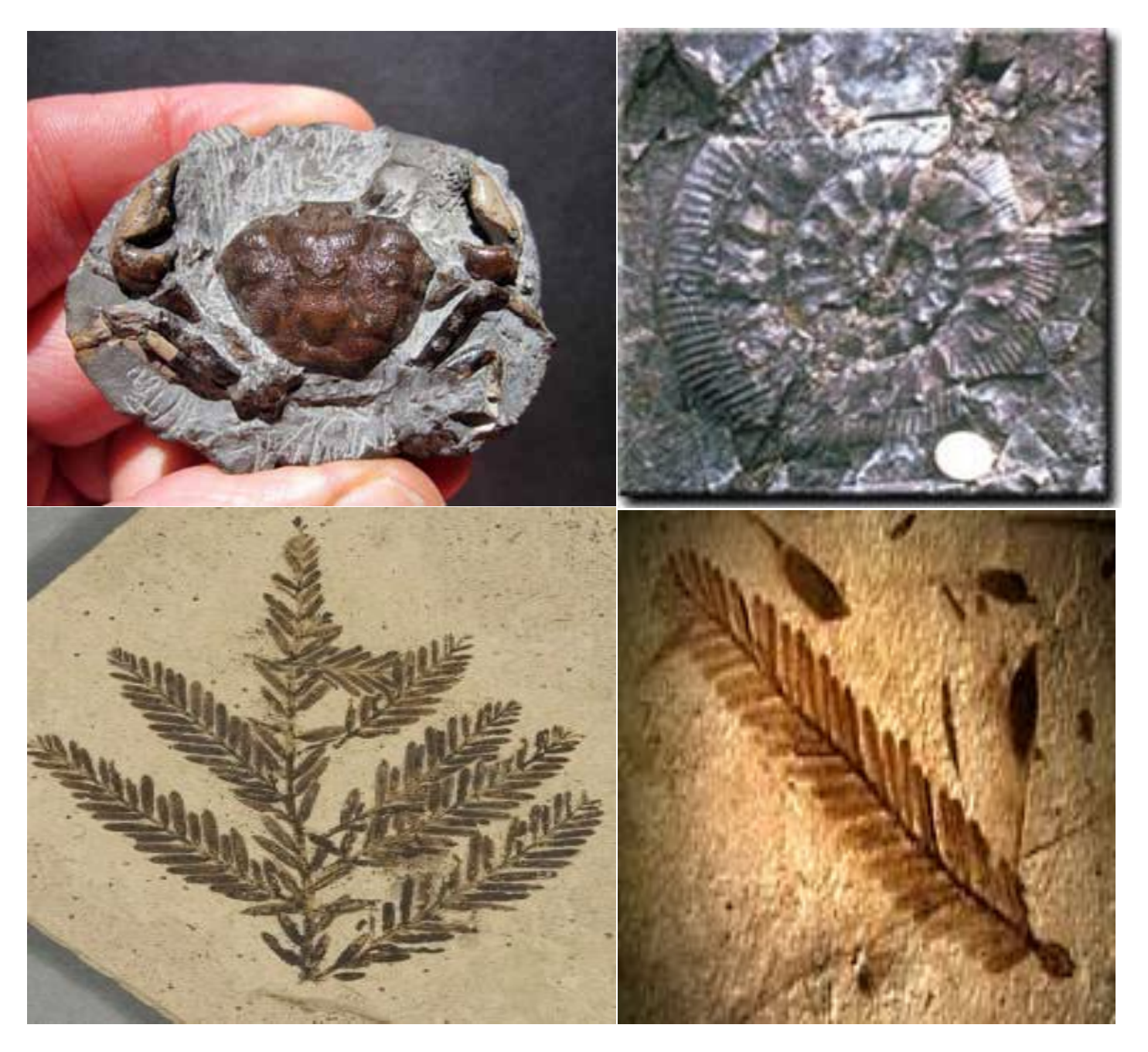
Some of the other Fossils found in Oregon area's. Please remember always check to see if its ok to dig for anything in the area you want to go to. Even in the city of Fossil, OREGON you have rules to follow, and where you can dig. I have gone to the Oregon coast and seen some fossils for myself, but wasn't sure if you can dig them out or not so I just took some pictures of them and left them there.