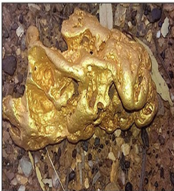
The "Fair Dinkum" nugget.

ICMJ's Prospecting and Mining Journal April 2016, Vol 85, No. 8.