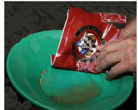
Felix Paydirt's Gourmet Gold

Saturday & Sunday March 21st & 22nd, 2020 10 AM to 5 PM