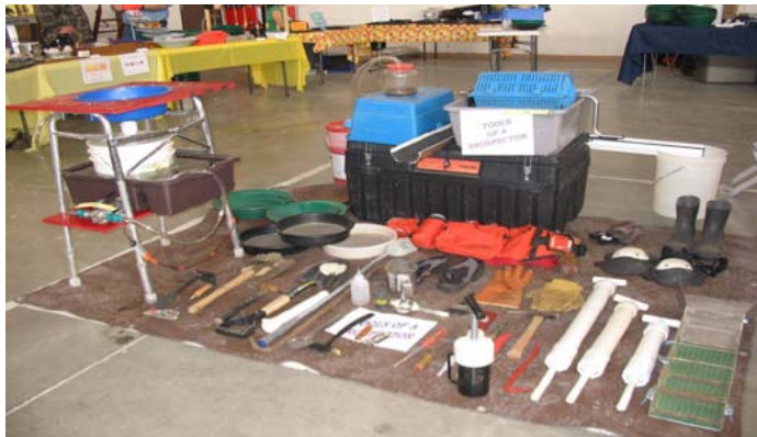
Some tools of a Prospector!