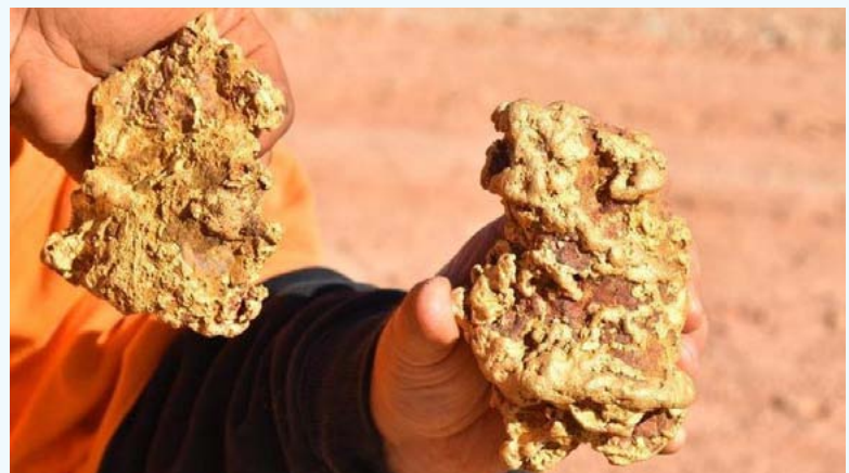
The nuggets weigh around 3.5kg (7.7 lb) in combined weight