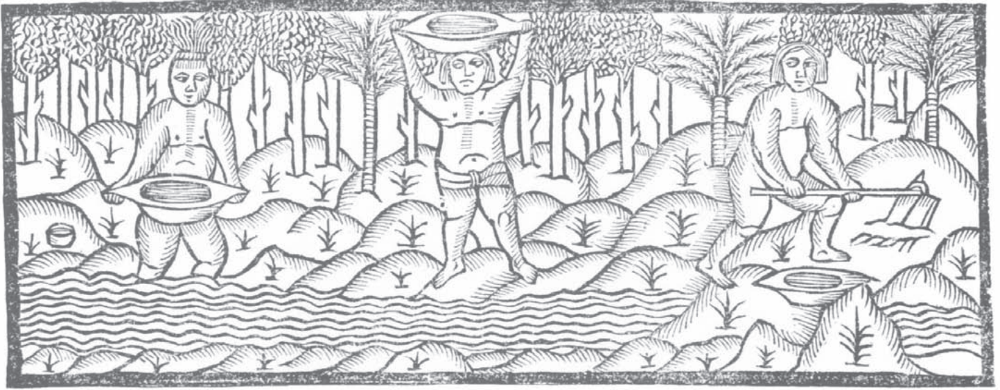
Panning Gold in New Spain, Early Colonial Period, c. 1535. The pans appear to be bateas.