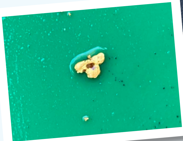
Notice the hole in the nugget.