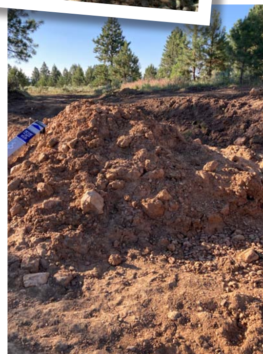
This is the pile with gold in it.