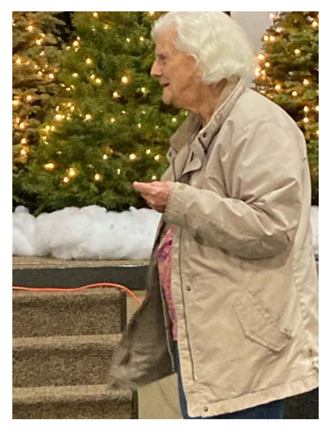
Mom finally gets a gold nugget for all her hard work at our gold shows.