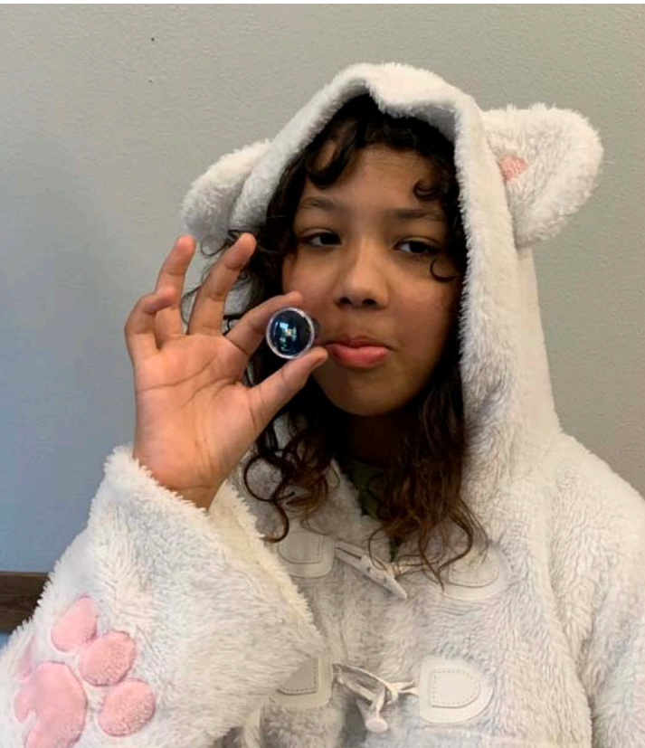
This young lady is the queen of the quarter drop!