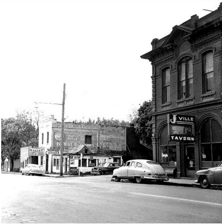
The J-Ville Tavern in downtown Jacksonville, occupying one of the town's historic buildings, as seen in 1961 before restoration.

BY THE END of 1852 , Table Rock City was the biggest town in Jackson County, boasting a population of about 2,000. Of course, as with all boomtowns, the good times couldn't last forever; but by now, it was the county seat, meaning that even after the gold petered out it would remain an important place. So unlike places like Auburn and Cornucopia, the town's residents built its houses and buildings with a future in mind.