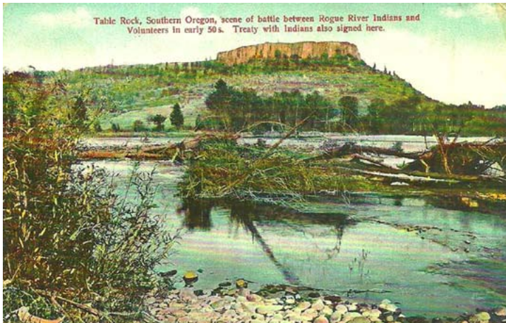
A postcard image of Table Rock, the mesa after which Table Rock City — now known as Jacksonville — was named.

That's right: in exchange for having one's gold tucked away safe from marauding bandits and night-stalking thieves, the bank actually charged a percentage of all deposits. It was like a negative interest rate. Or, you might think of it as the town where the bank "robs" you.