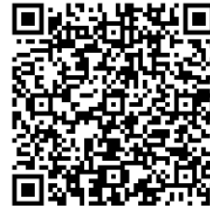
GPAA 3 Year Deal